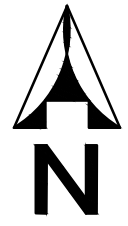
01 SITE LOCATION MAP SCALE 1:2500